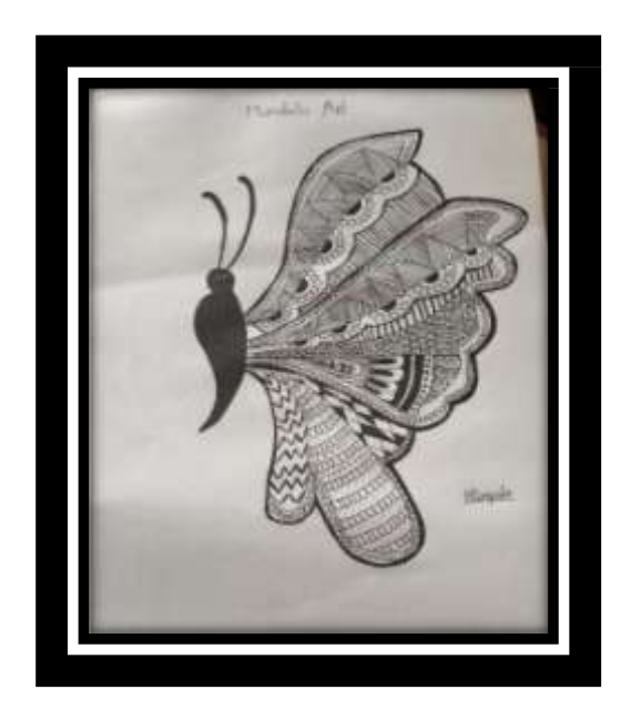
Hinal Pimpale SY MU