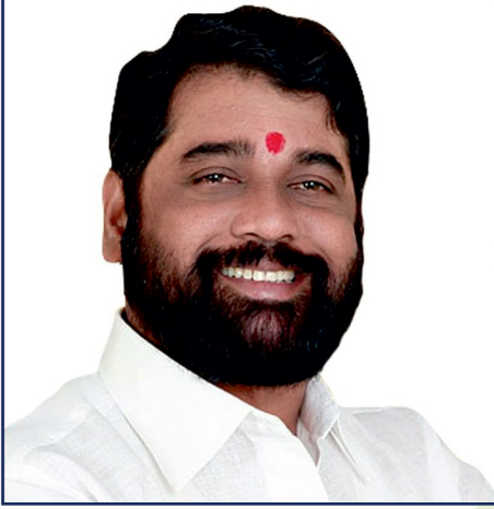
Hon. Shri. Eknath Shinde Chief Minister, Maharashtra State