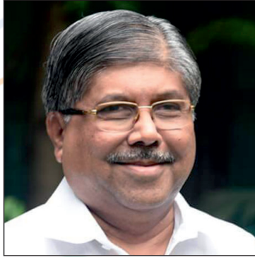
Hon. Shri. Chandrakant Patil Minister, Higher & Technical Education, Government of Maharashtra