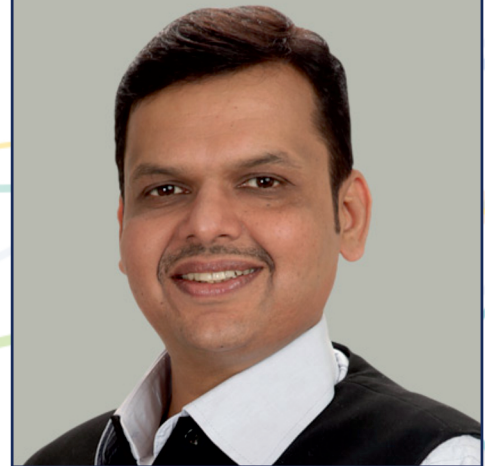
Hon. Shri. Devendra Fadnavis Dy. Chief Minister, Maharashtra State