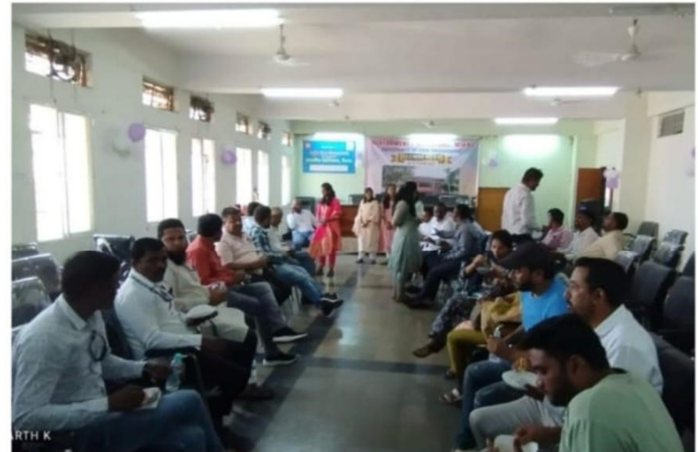
Alumni meet 28/10/2023(offline)