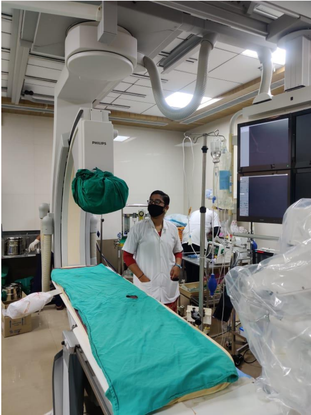
Student undergoing hospital training at Seva Sadan Hospital, Miraj (A.Y. 2021-22)