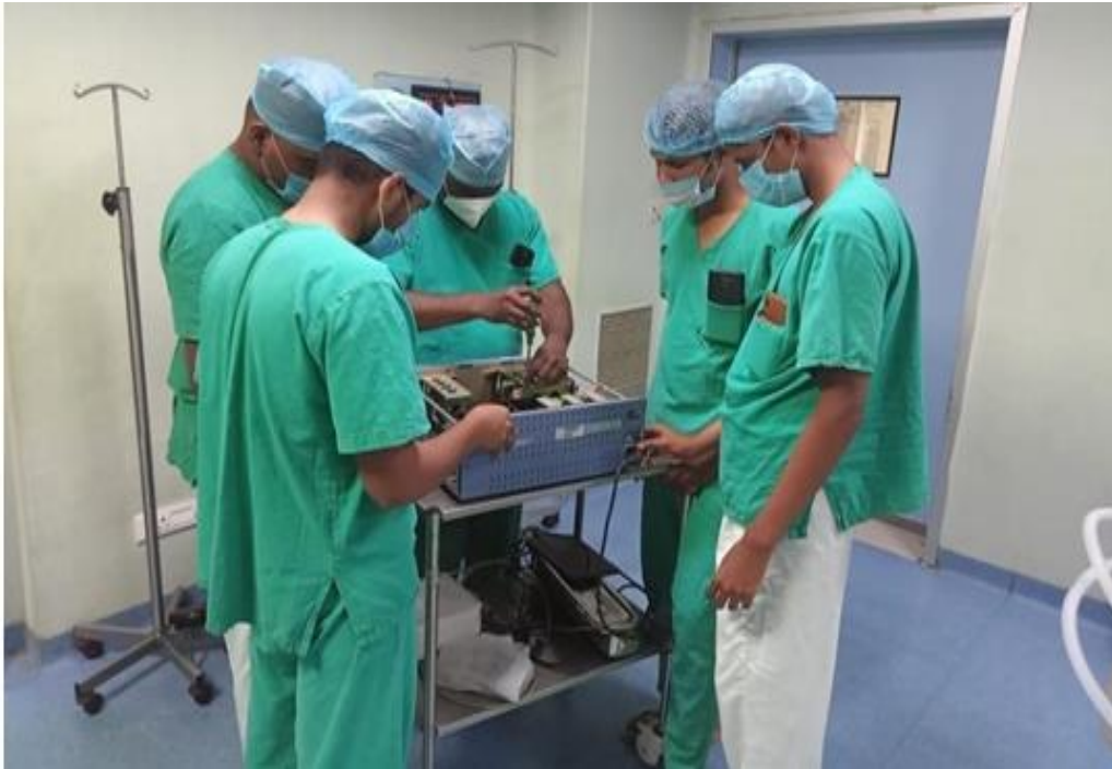
Student undergoing hospital training at Krishna Hospital, Karad (A.Y. 2021-22)

Final semester students of Department of Medical Electronics undergoing hospital trainings of various hospital.