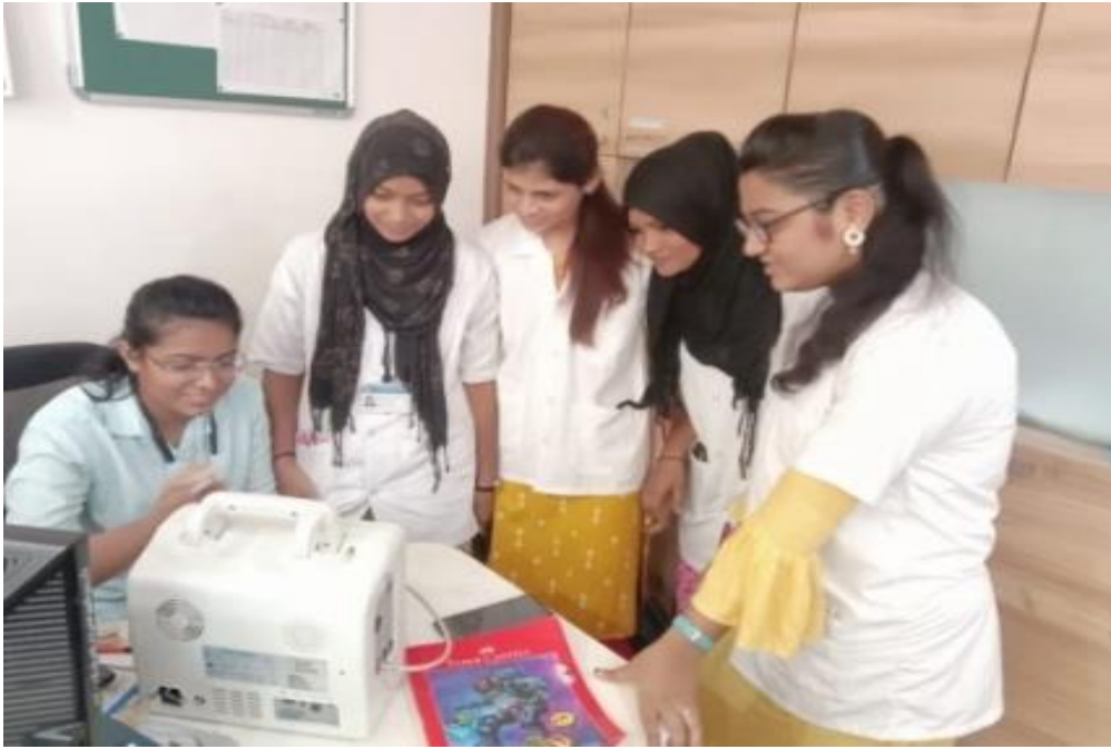
Student undergoing hospital training at Seva Sadan Hospital, Miraj (A.Y. 2021-22)