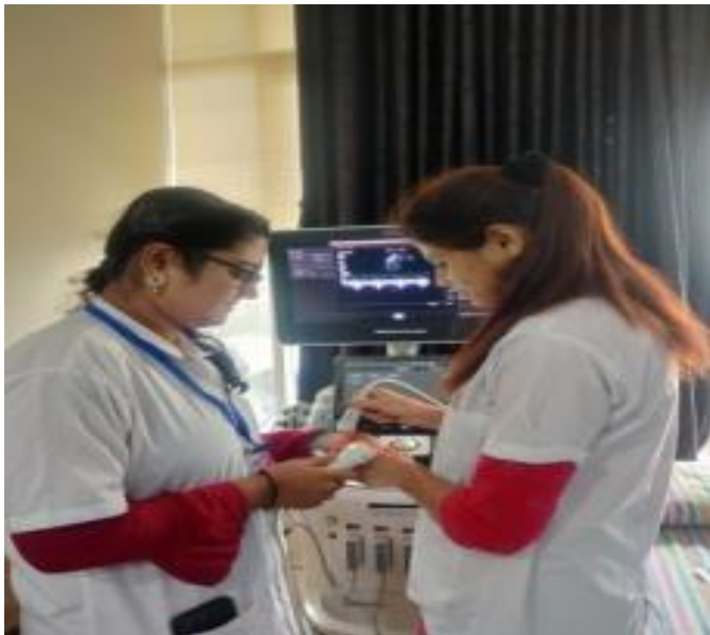
Student undergoing hospital training at Seva Sadan Hospital, Miraj (A.Y. 2021-22)