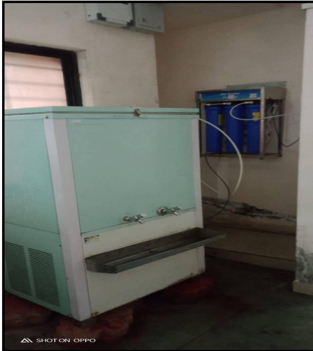
Cooler and RO Water Purifier