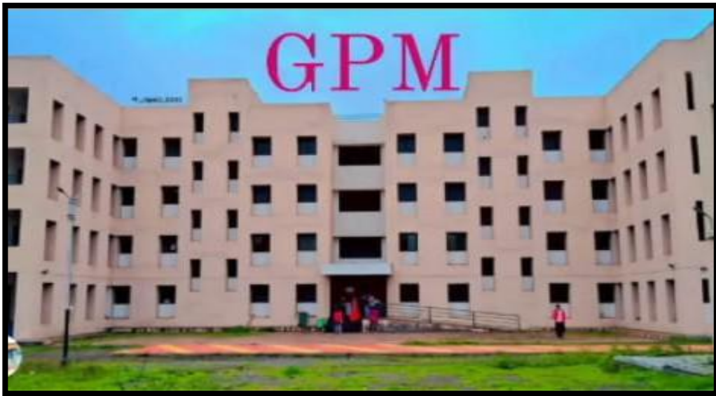
Dr. Panjabrao Deshmukh Girl's Hostel