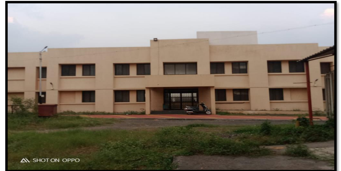
Minority Girl's Hostel